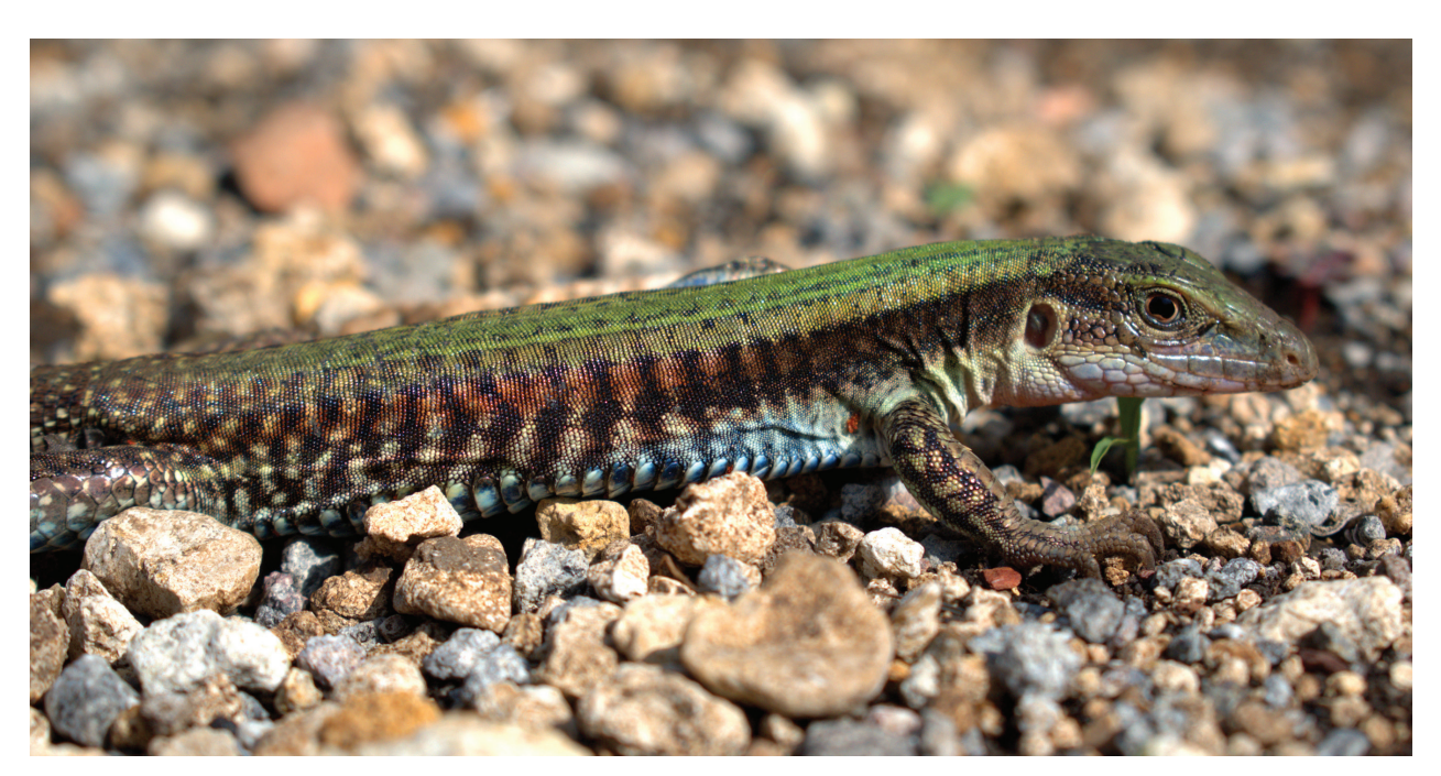
Figure 1. Adult female of Balsas Basin Whiptail, Aspidoscelis costatus costatus, from Ixtapan de la Sal, Estado de México, México.

Females of A. costatus costatus were captured by hand along a drift fence during their activity period (09:00-17:00 h) in June 2006, and from May to July 2007. The reproductive condition of each adult female was evaluated based on an abdominal palpation and a visual assessment, where the vitellogenic/gravid females showed an expanded contour in the abdomen region (Suárez-Varón et al. 2019). Snout-vent length (SVL) and mass were recorded to the nearest 1 mm and 0.1 g, respectively. Only vitellogenic and gravid females were euthanized via an intraperitoneal injection of sodium pentobarbital, and ovaries and oviducts were removed and placed in 10% neutral buffered formalin. Clutch size was estimated by counting vitellogenic follicles (≥ 3 mm, precision 0.01 mm, López-Moreno et al. 2016) or shelled oviductal eggs when present. We also calculated the relative clutch mass (RCM, based