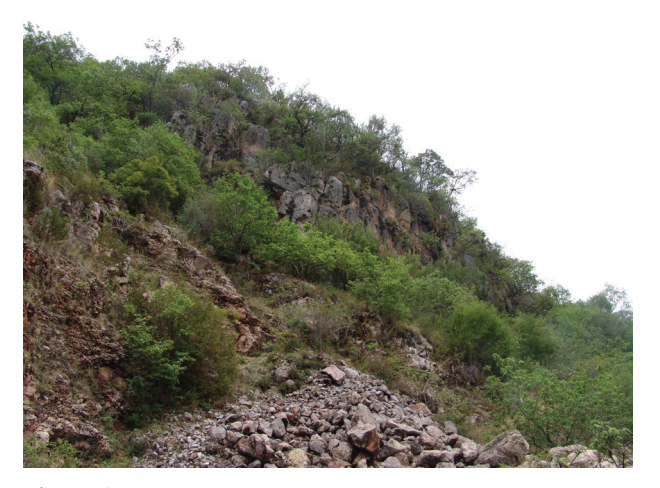
Figure 3. Habitat of Balsas Basin Whiptail, Aspidoscelis costa tus costatus , at Ixtapan de la Sal, Estado de México, México.

only on oviductal eggs) by dividing clutch mass (precision 0.0001 g) by female's total mass (including clutch weight; Tinkle 1972). All measurements were carried out following appropriate guidelines for Scientific Animal Use, unnecessary stress was avoided, and individuals were humanely sacrificed. Females were deposited in the Laboratorio de Herpetología, Facultad de Ciencias, Universidad Autónoma del Estado de México, México (voucher numbers pending). All lizards were collected under the Scientific Collector Permit, FAUT 0186 SEMARNAT (Secretaría de Medio Ambiente y Recursos Naturales).